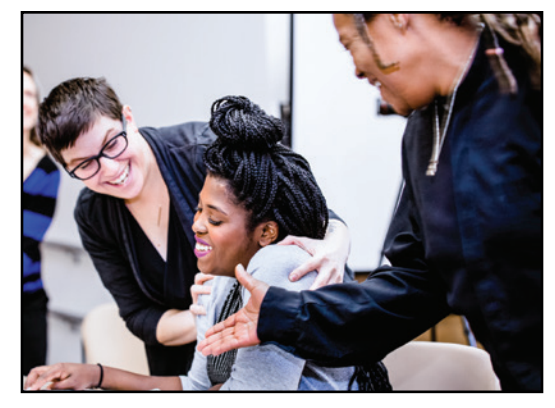
With your support, 4 out of 5 Tacoma students earn their degrees—two-thirds within the first two years<sup>1</sup>.

Thanks to donors like you, the Tacoma campus continues to thrive and grow, and Tacoma students also benefit from The Evergreen Fund and the Evergreen Scholarship Fund. In FY23, Evergreen Tacoma launched an Early Childhood Education program to meet demand in Washington State.