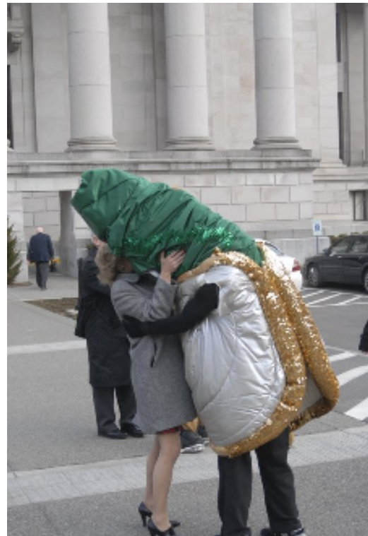
“Speedy” Greets Legislative Staff on The Hill