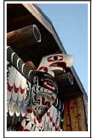
The new seminar building: A Work in Progress

In these uncertain times of budget constraints and turmoil, as well as uncertain economic and political events, becoming a teacher is a daily reward/struggle/challenge/rich life experience. Thank you for sharing your lives and energies with us during those 96-98 years.