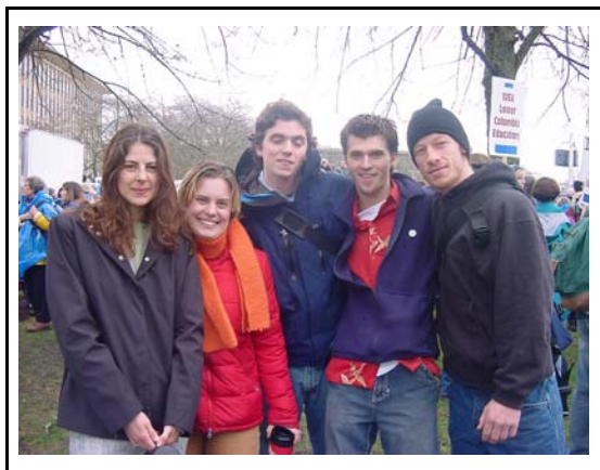
Current MIT students in downtown Olympia at the teacher's rally in January 2003.