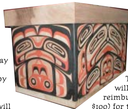
by Andrea Wilbur-Sigo (Squaxin Island)

The 2 nd Gathering of NW Native Carvers will take place on May 20-21, 2005 at the Longhouse. Funded by the National Endowment for the Arts, the gathering will include one day of discussions and workshops specifically for Native carvers and one day of demonstrations by featured carvers, which will be open to all carvers and the public.