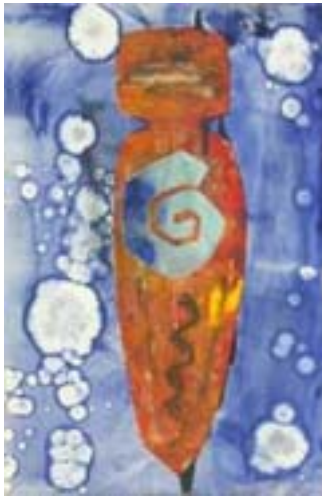
After the Rain