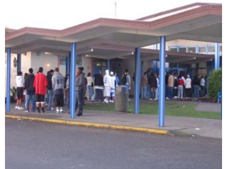
The line is long...but it's worth the wait. The ACT will be done!