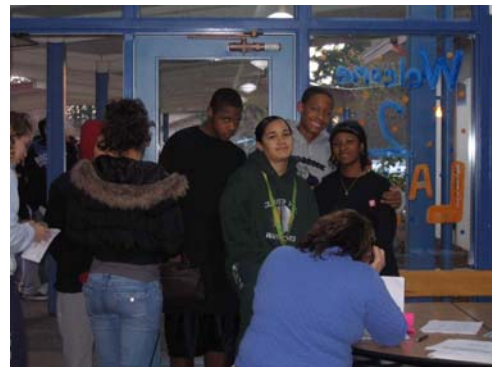
Yes! We are ready.