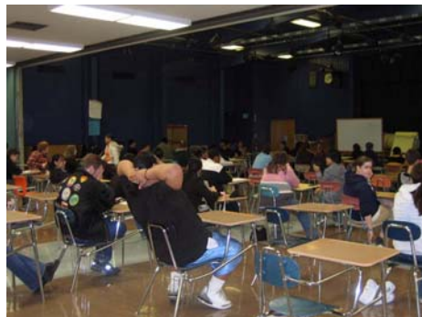
Ready and waiting to get started. BRING IT ON!!