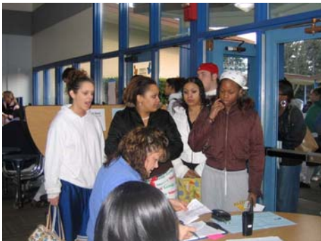
Being Proactive. Tackling the college testing obstacle as juniors. WOW!!