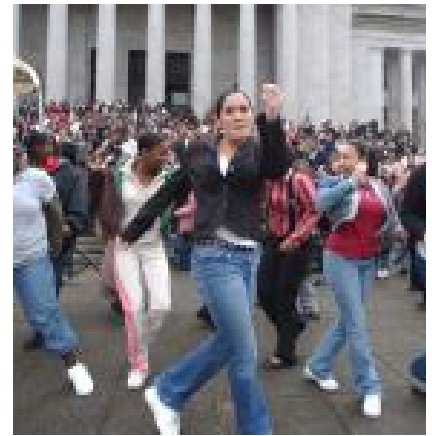
CPHS students participate in an impromptu dance contest at the Capitol

GEAR UP provided transportation for this event.