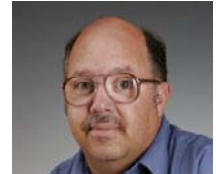
Ed Specialist College Coach